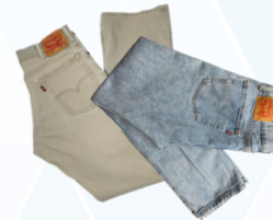
Khaki & Jeans