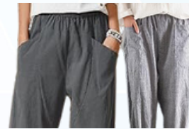
Pants & Trousers