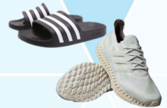
Slipper, Sport Shoes

Shorts, t-shirts, jeans, denims, sandals, sport shoes or slippers are strictly prohibited.