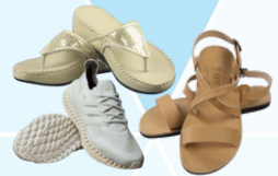
Sandal, Sport Shoes Uncovered Shoes

Mini skirt, short pants, jeans, denims, sandals or slippers are strictly prohibited.